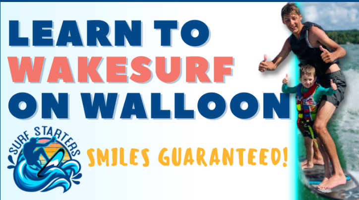
Facebook and Instagram Advertisements