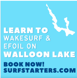
Business Card Back