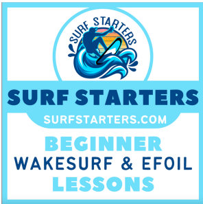
Business Card Front